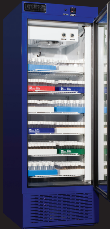
Cat # 59-400