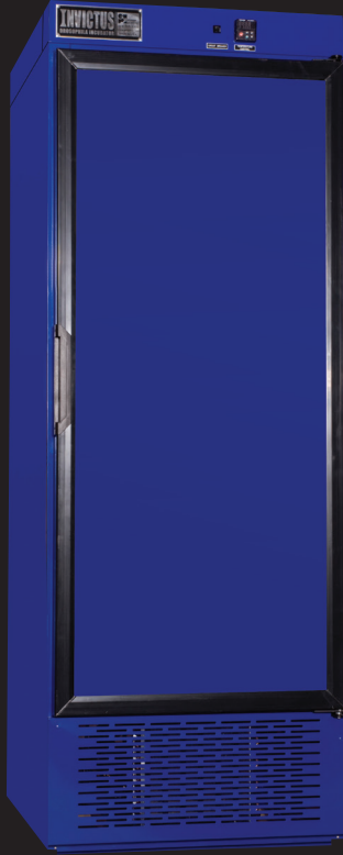
Cat # 59-400L & 59-400LH

For an additional charge, Genesee Scientific can arrange for your INVICTUS to be delivered to your lab, installed and for all packing materials to be disposed off. Customer must specify if 'White Glove' delivery service is required at time of order. Genesee Scientific will not be responsible for any redelivery charges.